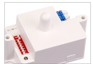
AVAILABLE WITH MICRO-WAVE SENSOR FITTED